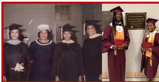
1967 RCTS Teachers and 2018 RCTS Scholarship Recipients (Handley High School)